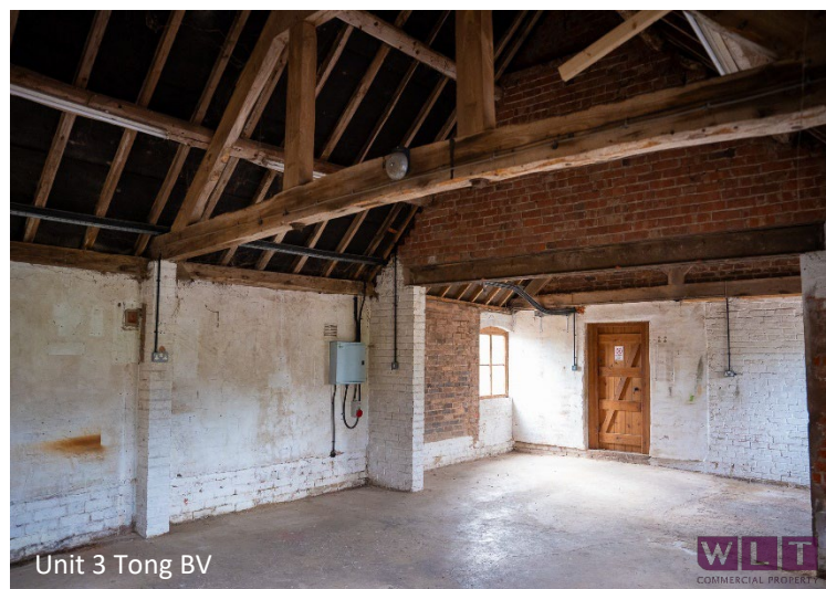
Unit 3 Tong BV

Tong Business Village is conveniently located adjacent to the A41, accessible via a private driveway. It is approximately 8 miles east of Telford Town Centre, 12 miles north of Wolverhampton City Centre, and 1.5 miles north of Junction 3 on the M54.