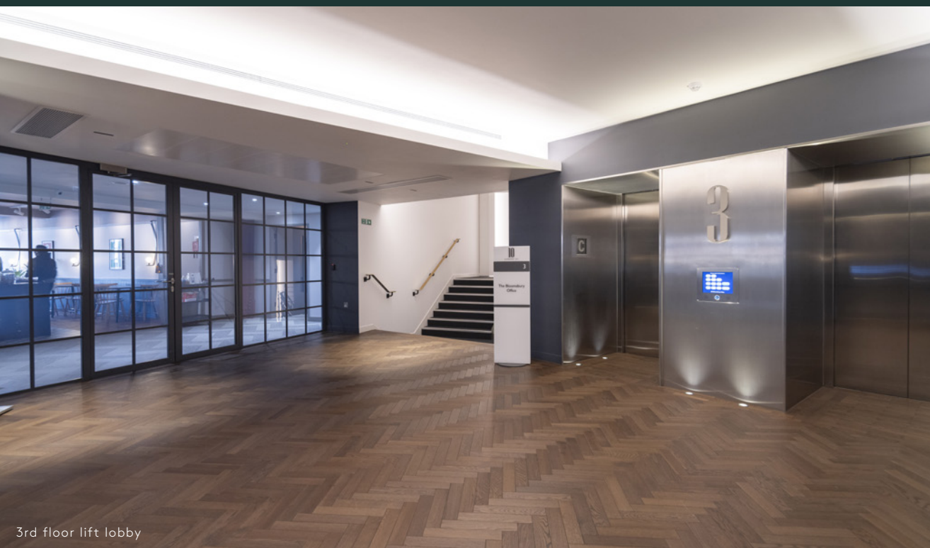
3rd floor lift lobby