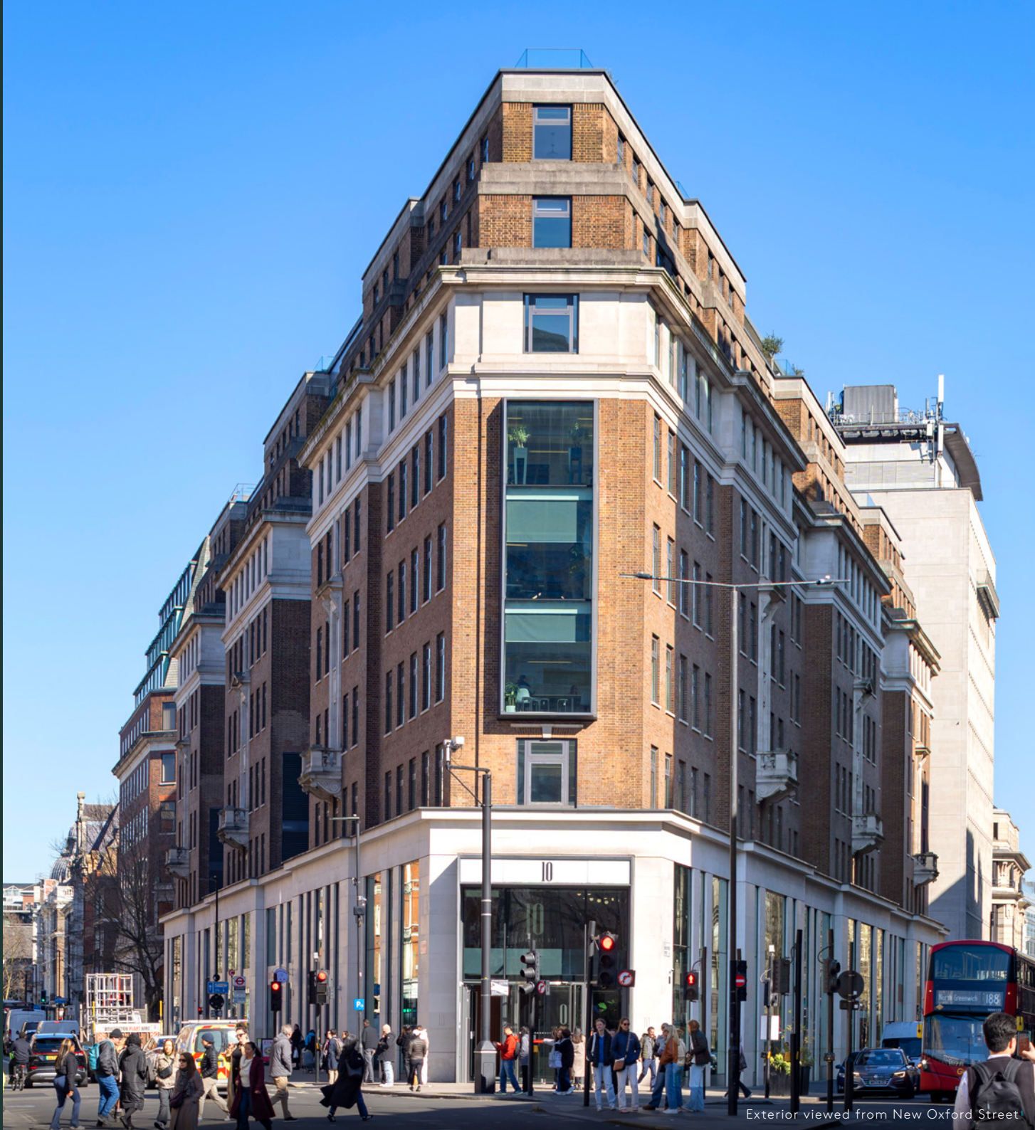
Exterior viewed from New Oxford Street

Set within this unique corner building, 10 Bloomsbury Way offers up to 53,977 sq ft of fully fitted and furnished contemporary office space across 3 floors. With expansive layouts featuring desks, meeting rooms, focus booths, kitchens, and breakout areas, the versatile workspace is designed for collaboration, creativity, and focus.