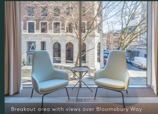
Breakout area with views over Bloomsbury Way