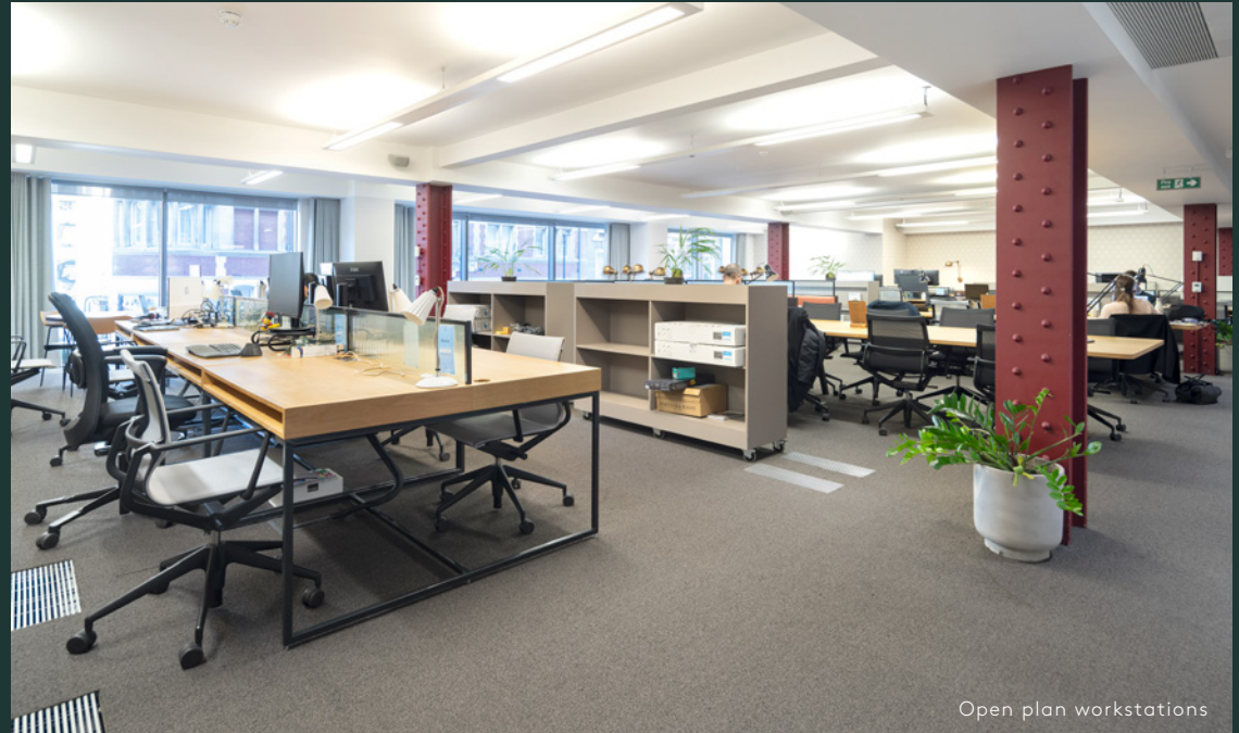
Open plan workstations

On-site cafe located on the Ground floor