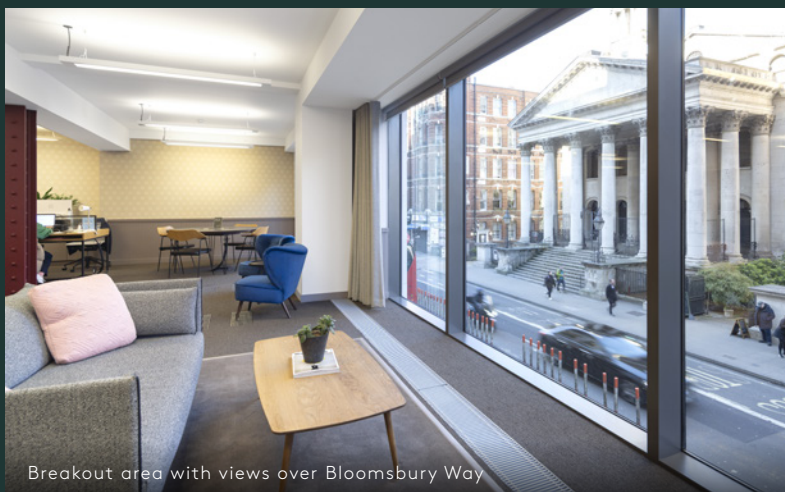
Breakout area with views over Bloomsbury Way