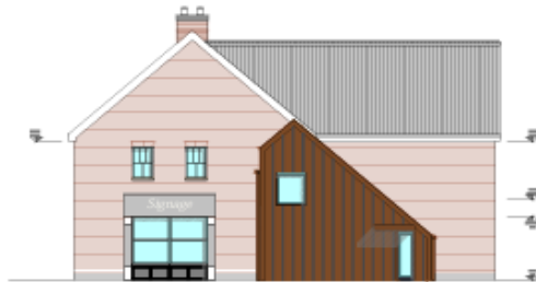
SOUTH ELEVATION (Brown Standing Seam)