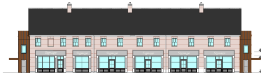
WEST ELEVATION (Brown Standing Seam)