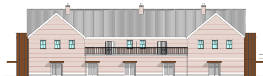
EAST ELEVATION (Brown Standing Seam)