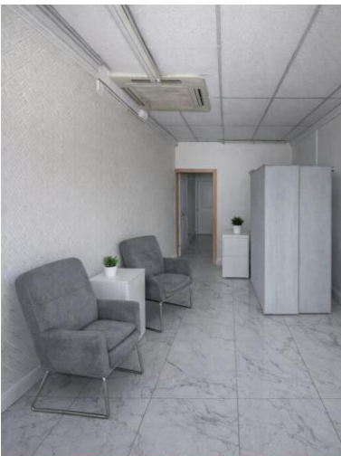
This image has been virtually decluttered and enhanced and is for illustrative purposes only.