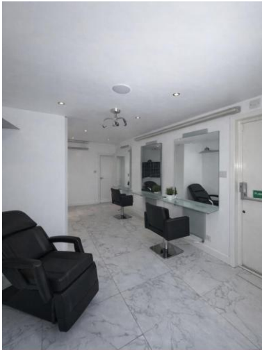
This image has been virtually decluttered and enhanced and is for illustrative purposes only.