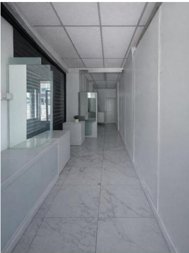
This image has been virtually decluttered and enhanced and is for illustrative purposes only.

Jack Scotter 0207 403 0600 jacks@kalmars.com