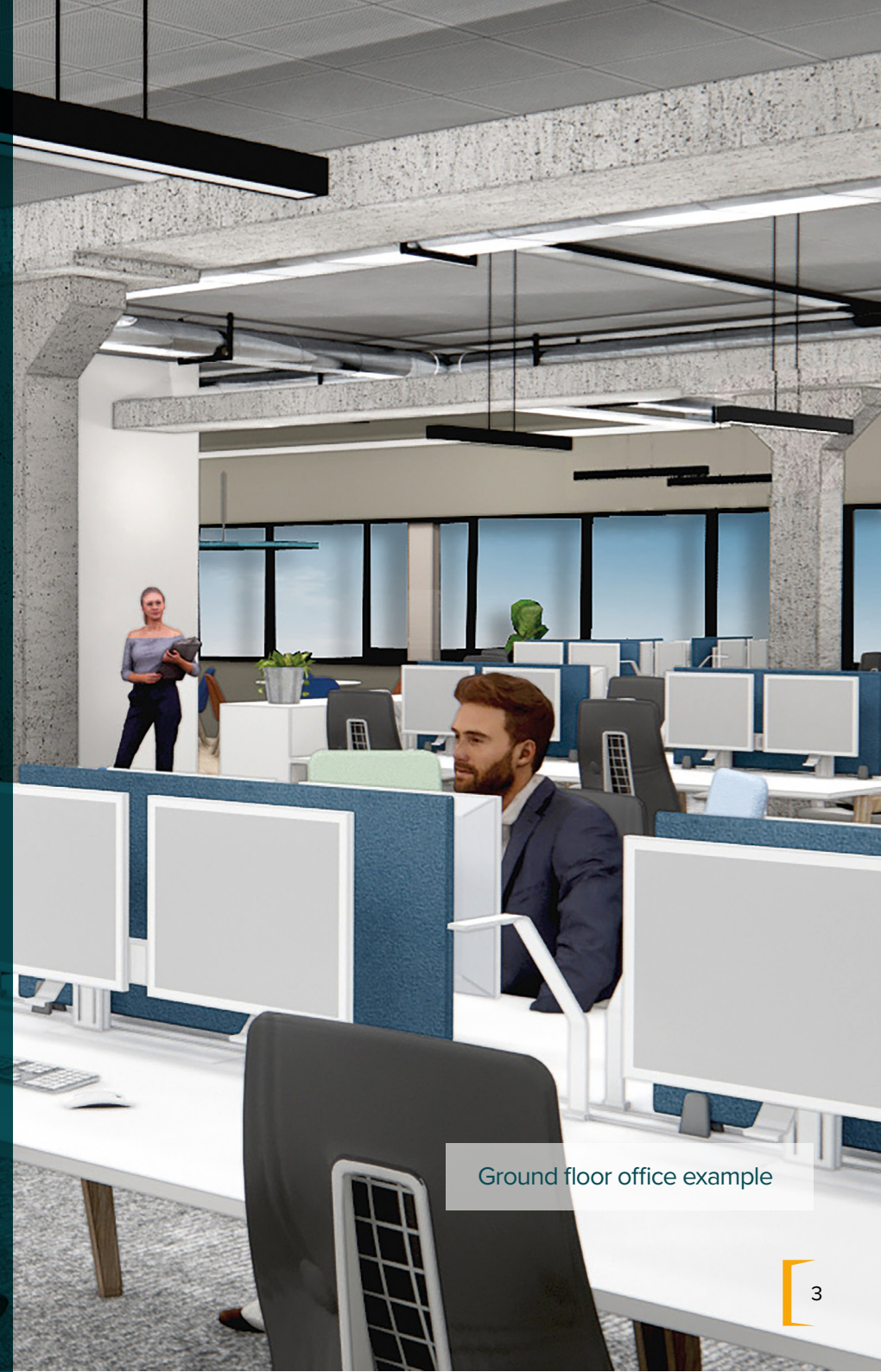
Ground floor office example