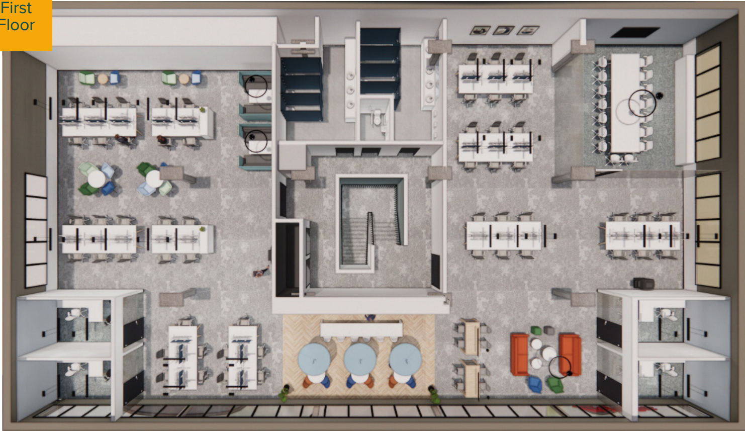
CGI 3D floor plans are for illustrative purposes only.