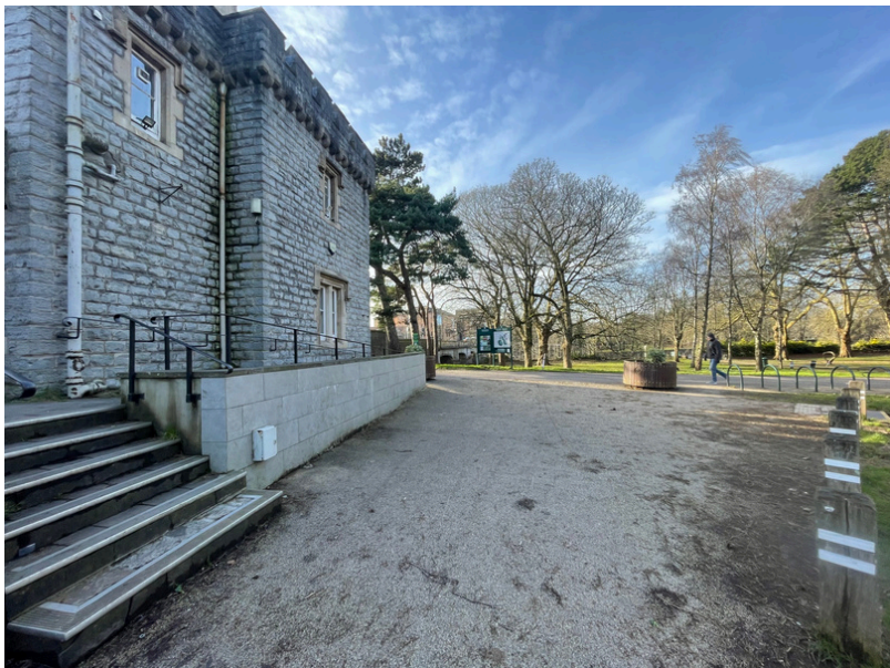
Outside Seating Area