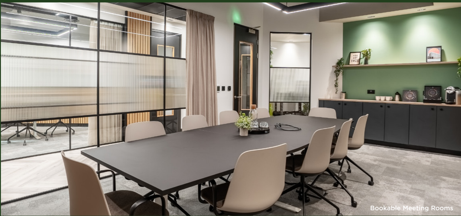
Bookable Meeting Rooms