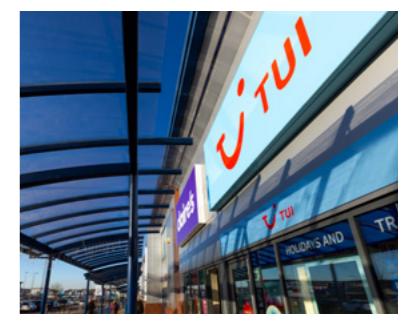
TUI TUI offers unforgettable holidays with expertly curated destinations, seamless booking, and exceptional service every step of the way. IG: @tuiuk