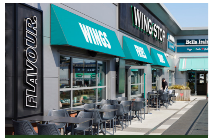
Wingstop Wingstop serves up mouthwatering, perfectly seasoned wings, creating the ultimate comfort food experience. IG: @wingstopuk