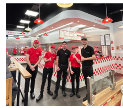
Five Guys Fresh, customisable burgers with hand cut fries, and don't forget about their infamous shakes. Perfect for a quick bite. IG: @fiveguysuk