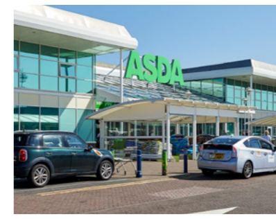
ASDA ASDA brings great value to everyday shopping, from fresh produce to household essentials at unbeatable prices. IG: @asda