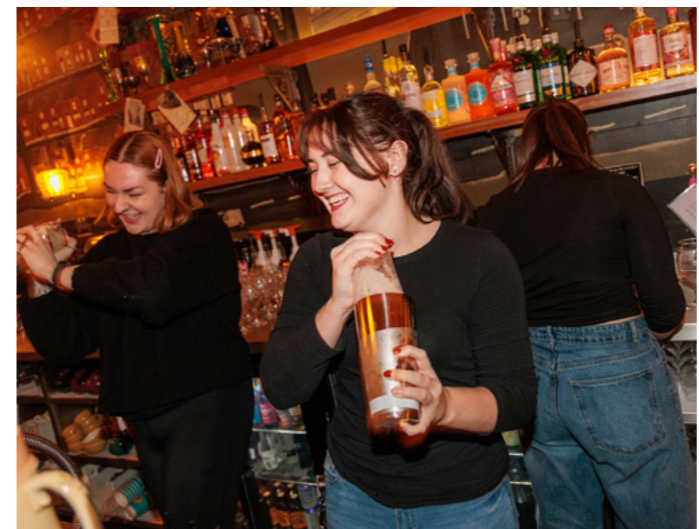
Blanco Lounge Blanco Lounge is a home-from-home, offering tasty food and drinks available all day, every day. IG: @thelounges