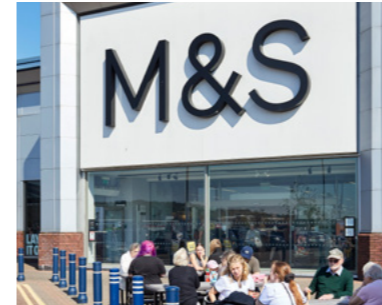
M&S M&S combines quality and style, offering fresh food, wardrobe staples, and home essentials all under one trusted roof. IG: @marksandspencer