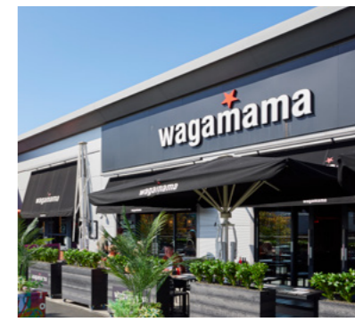
Wagamama Wagamama serves vibrant, Asian-inspired dishes in a relaxed, modern setting, perfect for satisfying every craving. IG: @wagamama_UK