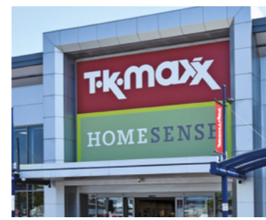
TK Maxx / HomeSense HomeSense and TK Maxx offer a treasure-hunt experience full of unique homeware finds from top brands. IG: @tkmaxxuk