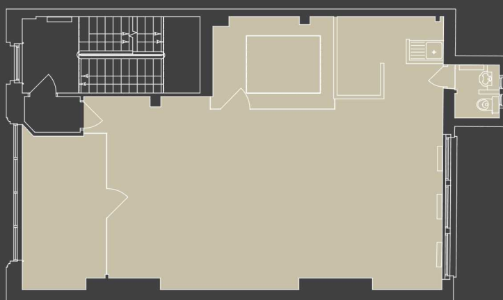
Second floor plan.

Strictly by appointment through the joint sole agents:-