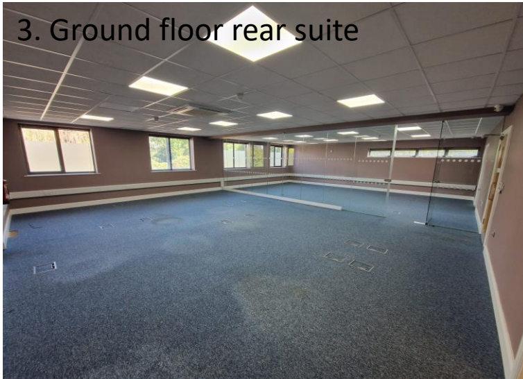
3. Ground floor rear suite