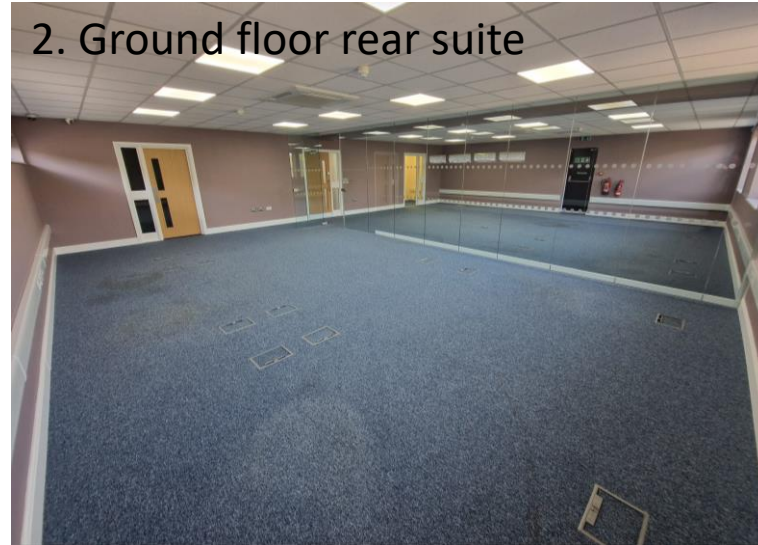
2. Ground floor rear suite