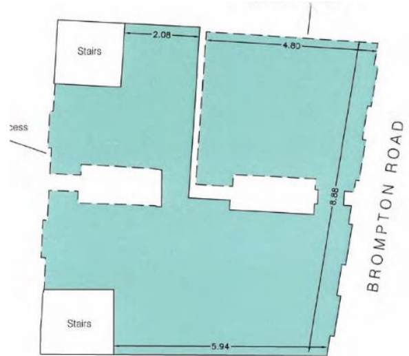
Floor Plan - (not to scale – for indicative purposes only)