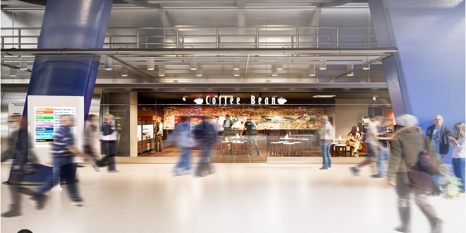
Retail Unit – North Greenwich Underground Station