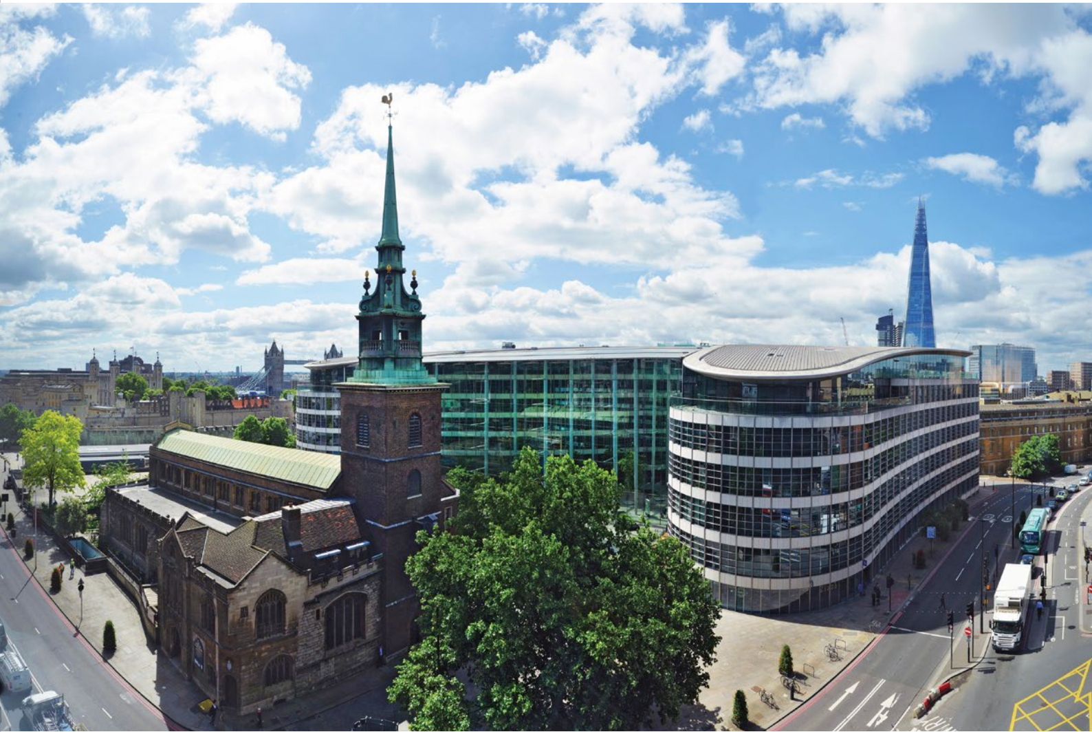
View from the 6th Floor