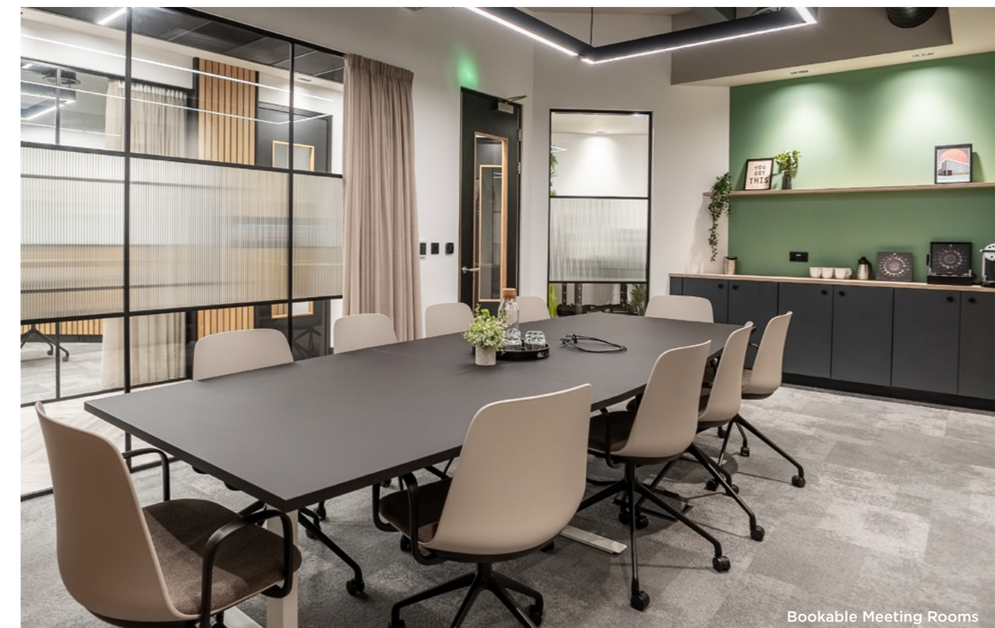
Bookable Meeting Rooms