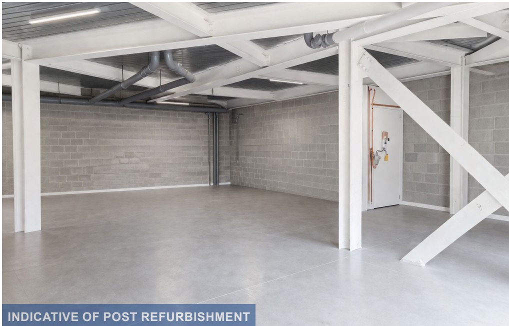
INDICATIVE OF POST REFURBISHMENT

Each party will be responsible for their own legal costs incurred, with the ingoing tenant being responsible for any Land & Buildings Transactional Tax, recording dues and VAT as applicable.