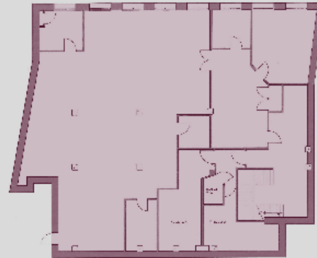
Second Floor Level