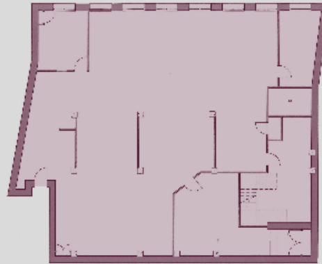
First Floor Level