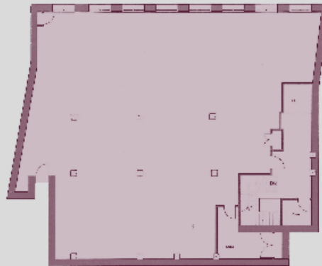
Third Floor Level