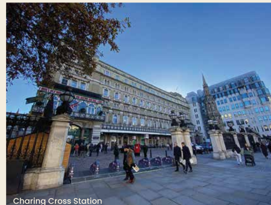
Charing Cross Station

London Victoria Station (15-minute walk) is one of the main rail terminals nearby, providing services to the south of England, including Brighton, Gatwick, and other coastal destinations. Charing Cross Station (10-minute walk) offers services to southeast London and Kent.