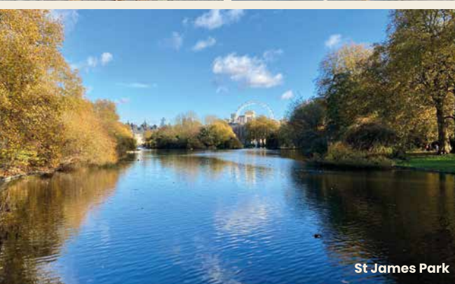
St James Park