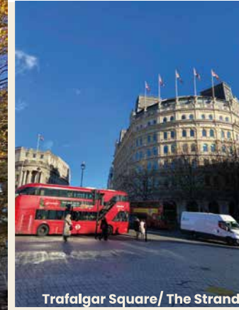
Trafalgar Square/ The Strand