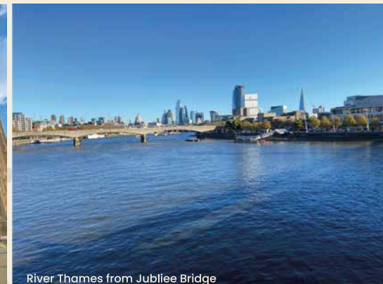
River Thames from Jubilee Bridge

WHITEHALL IS ONE OF LONDON'S MOST WELL-CONNECTED AREAS, OFFERING EXCELLENT TRANSPORT LINKS FOR EASY ACCESS TO VARIOUS PARTS OF THE CITY AND BEYOND.