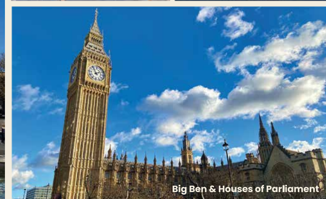
Big Ben & Houses of Parliament