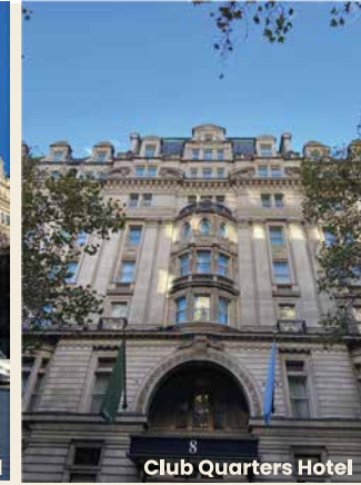
Club Quarters Hotel