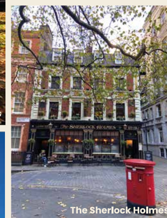
The Sherlock Holmes