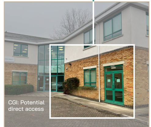
CGI: Potential direct access