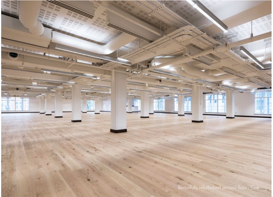
Beautifully refurbished second floor office

For more information or viewings please contact the joint agents: