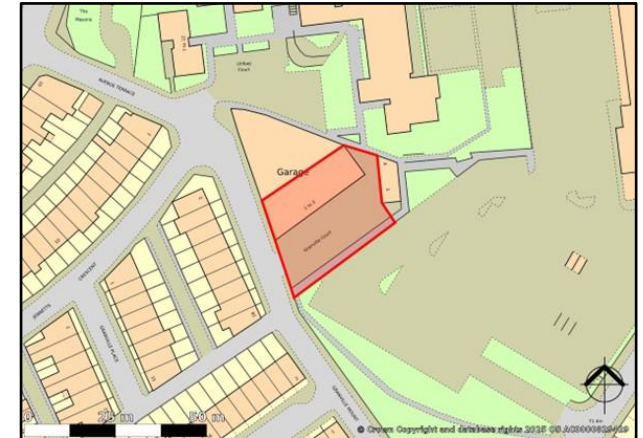
Red – Proposed freehold boundary